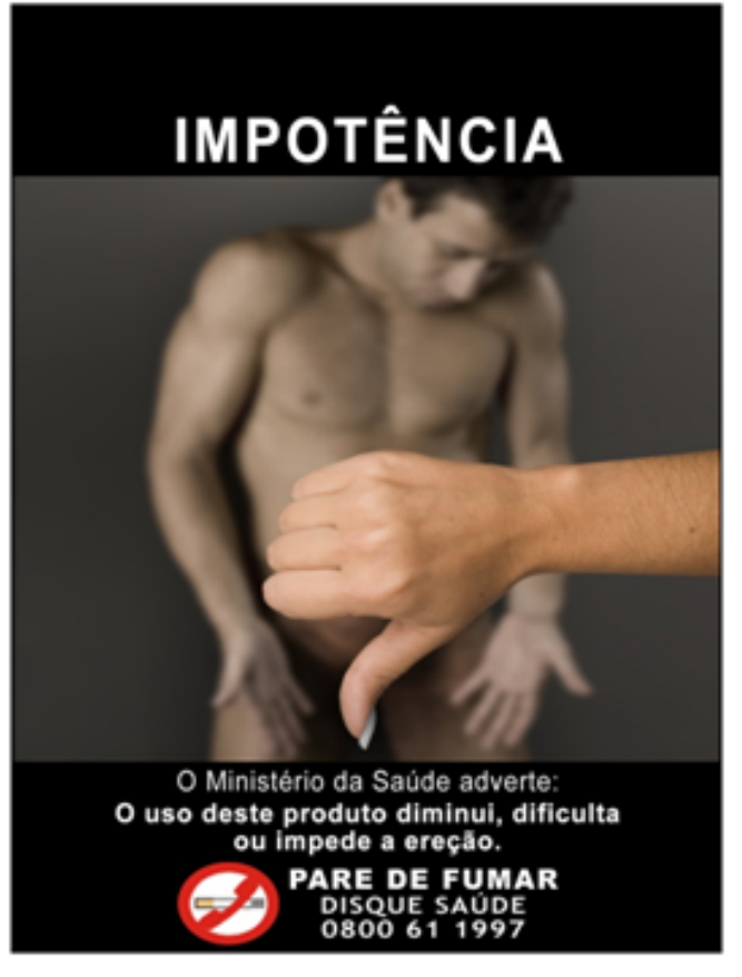
Figure 3. Examples of warnings on cigarette packages in Brazil. doi:10.1371/journal.pmed.1001336.g003