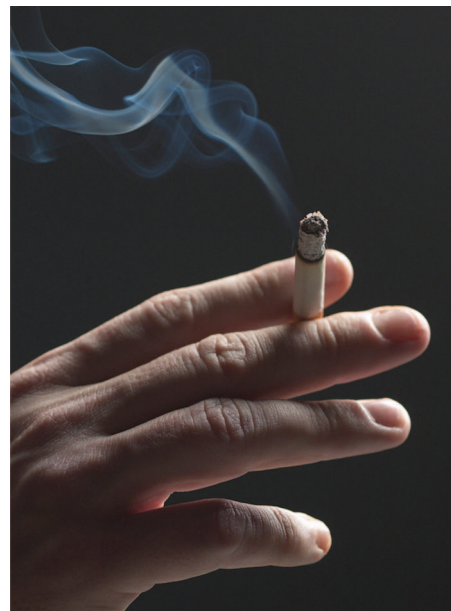
Fig. 1. Tobacco smoking is the most important risk factor for lung cancer and also has harmful effects on other NCDs.

Mirroring the high lung cancer risk in individual smokers, lung cancer death rates vary substantially across populations and over time based on smoking histories. In adult men, lung cancer death rates increased for much of the 20th century and peaked at ~170 to 190 per 100,000 (10) in a few Western European countries and the United States and subsequently in Central and Eastern European countries like Hungary (Fig. 2A). These peaks in lung cancer death rates tracked the peak of the smoking epidemic with a lag of about two decades. In women, lung cancer death rates in the majority of countries were less than 10 per 100,000 in the 1950s, virtually the same as men and women in Western countries who have never smoked (11). Women's lung cancer mortality began to increase two to three decades after that of men, reflecting the rise in women's smoking after World War II, first in English-speaking high-income countries and then in continental Europe. Owing to effective tobacco control and the decline in women's smoking, lung cancer death rates in women appear to have peaked in English-speaking countries, for example, at ~60 per 100,000 in the late 1990s in the United States (Fig. 2B). The situation is not all good, however, and lung cancer mortality continues to increase in women in Continental Europe. For example, the lung cancer death rate of Danish women, who have smoked longer and more than women in other European countries, is now higher than that of American women.